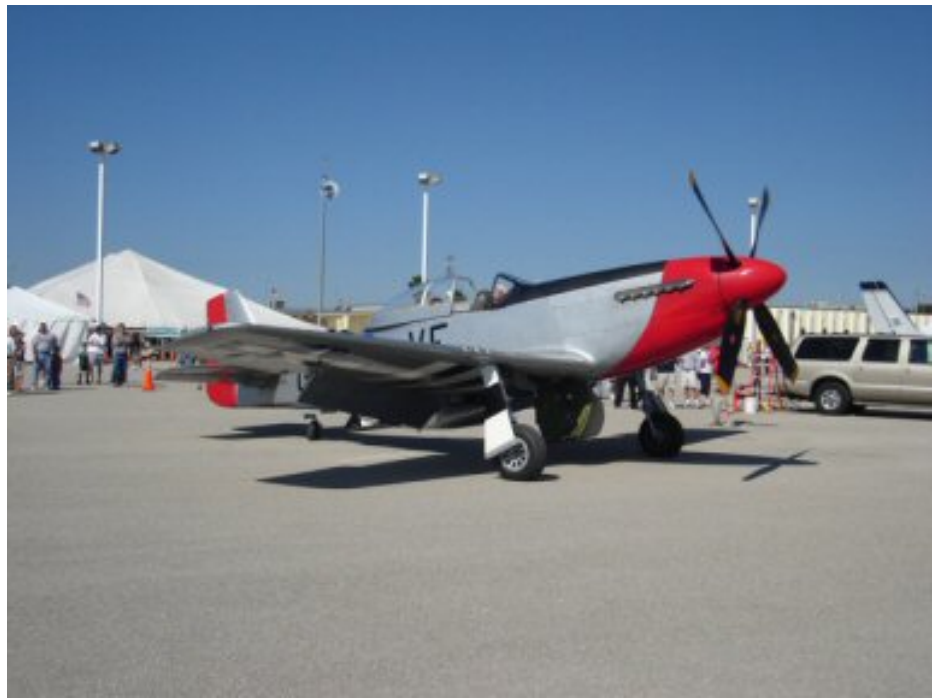
North American P51 "Red Nose" was delivered new from the factory to Page Field during World War II

Lee County Port Authority presents and is the major sponsor of Aviation Day at Page Field.