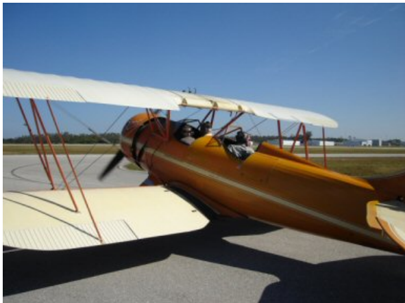
Another trip into the wild blue yonder in a Waco Biplane