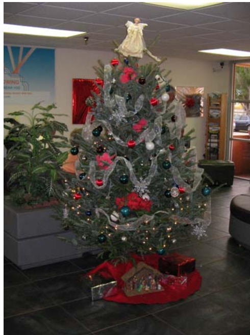
Christmas tree at the Page Field Aviation Center

Added his interest and support to the observation area and scholarship projects that have been proposed for Page Field. Reminded everyone that "Aviation Day is every day".