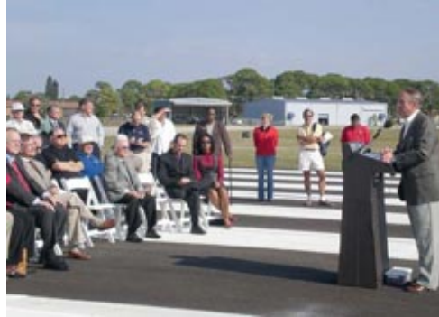
On the runway at Venice, Florida

Runway 13-31 had been closed since July for rehabilitation.