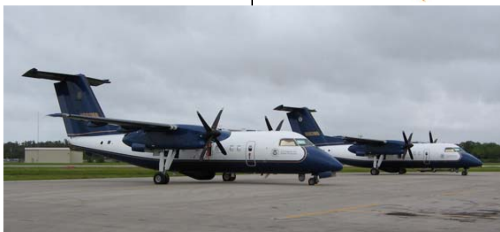
A pair of Bombardier DHC-8-202 aircraft owned by the U.S. Customs and Border Protection at Page Field recently

"When the younger generation is looking for a role model and hero, they need to look no further than Barrington Irving," Meek told The Miami Herald. "This young pilot proved that when you dream big dreams and work hard, the extraordinary is possible. I am honored to call Barring-