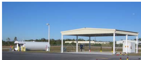
New self serve maintenance and fuel.

A Safety meeting, titled “Runway & Airport Safety” will be held on Wednesday, February 22, 2006 at 7:00 pm at the RSW Training Center. Representatives from FMY and RSW Air Traffic Control will be speaking.