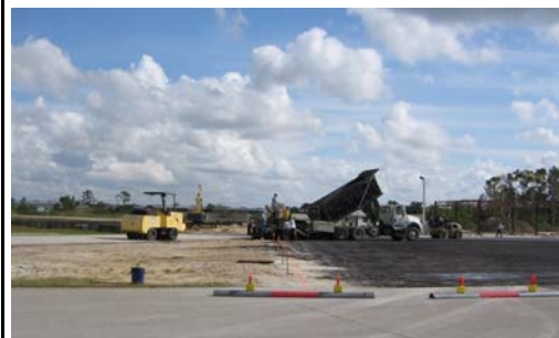
Paving at new self serve maintenance and fuel.

The Florida Suncoast Chapter of the 99s will hold their March meeting at the EAA building at Page Field, on Saturday, March 11, 2006 at 10:30 am . A representative from Page Tower will speak. Read more >>