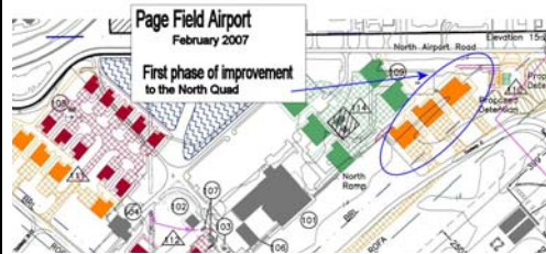
Construction at the North Quad

These improvements will be done in phases as funding becomes available.