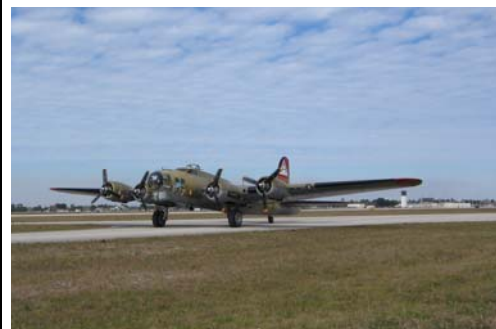
Boeing B-17 at Page Field recently Owned by the Collings Foundation

The glideslope transmitter for the ILS instrument approach to Runway 5 at Page Field is out of service so that it can be relocated. It expected to be back in service in April 2007.