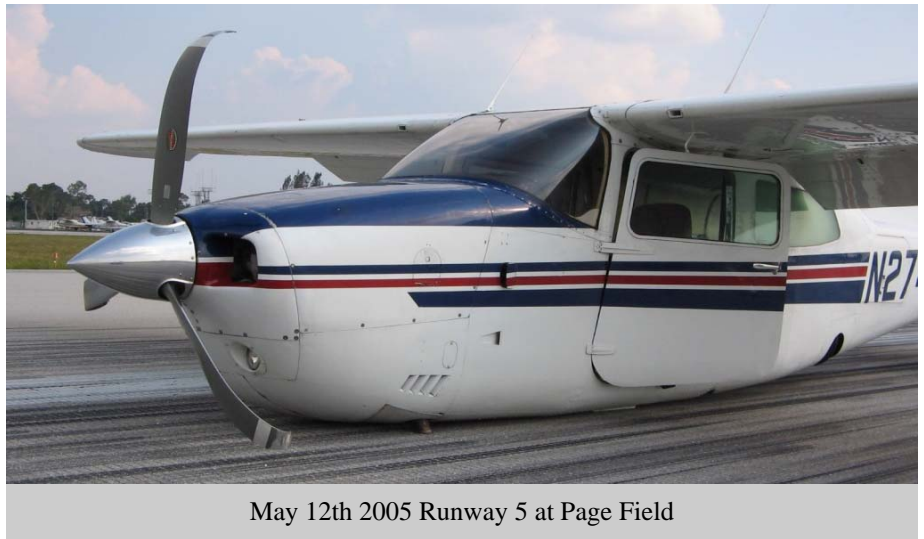
May 12th 2005 Runway 5 at Page Field