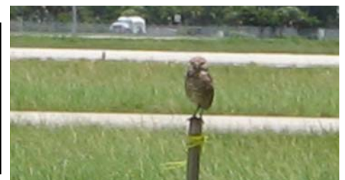
A Page Field tenant, checks the weather.