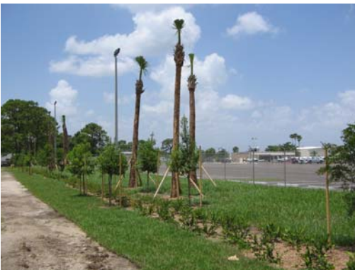
New landscaping along Danley Drive at Page Field

Announced that a computer with the names and other personal information of more than 133,000 Floridians was stolen near Miami, Florida. read more >>