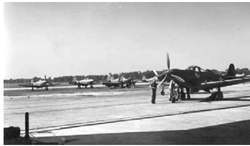
Bell P-39 Airacobra at Page Field during WW II

Permits for the picnic shelter at the Foxtrot hangar complex are done and work will begin soon.