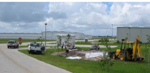
Picnic shelter construction near the restrooms at the Fox-trot hangar complex

Gary Duncan - L.C.P.A. Port Authority is hoping to make Aviation Day a larger show with more vendors, activi-