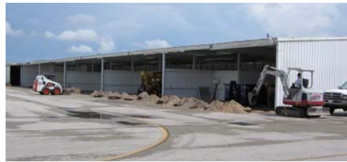
Door replacement on the Bravo hangars

Paul Yocum - EAA Chapter 66 Suggests that a plan to utilize empty t-hangars during storm emergencies be formed.